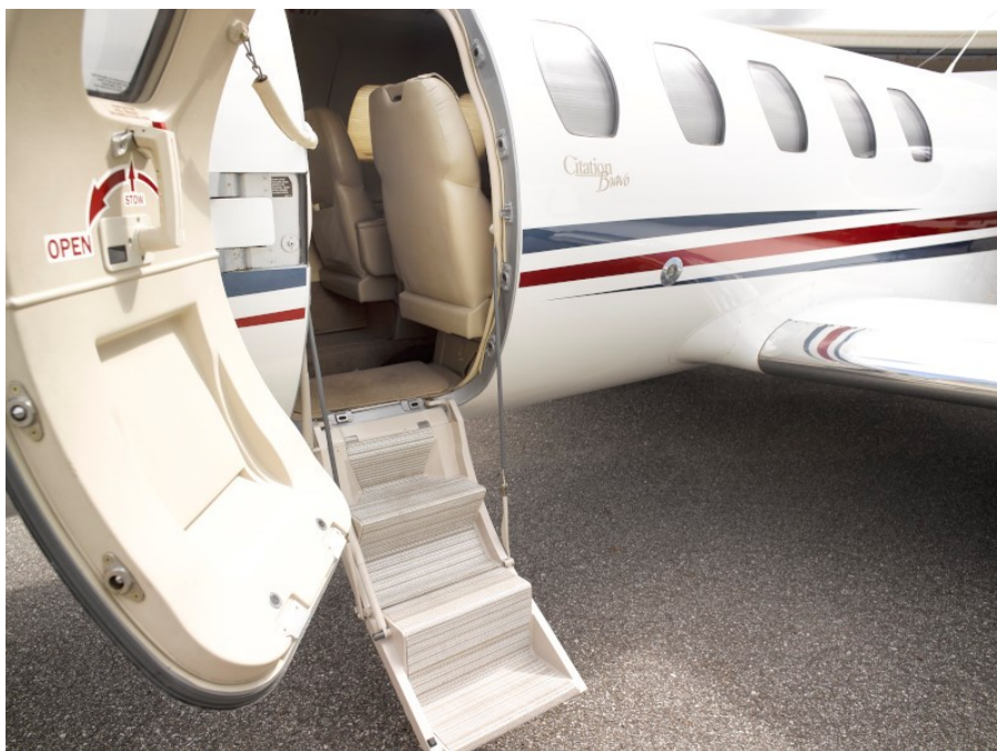
Encore Entry Step

GLOBAL HEADQUARTERS 5525 N.W. 15 th Avenue, Suite 301B · Fort Lauderdale, Florida 33309 +1 (954) 703-1600 · www.eastcoastjetcenter.com