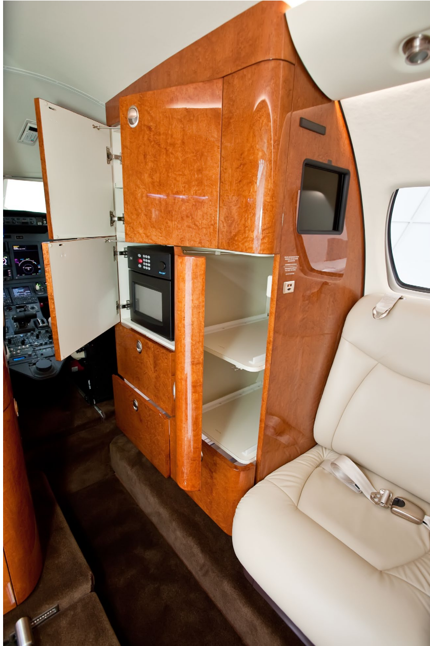
MAIN CABIN – STORAGE RH FWD SIDE SEAT