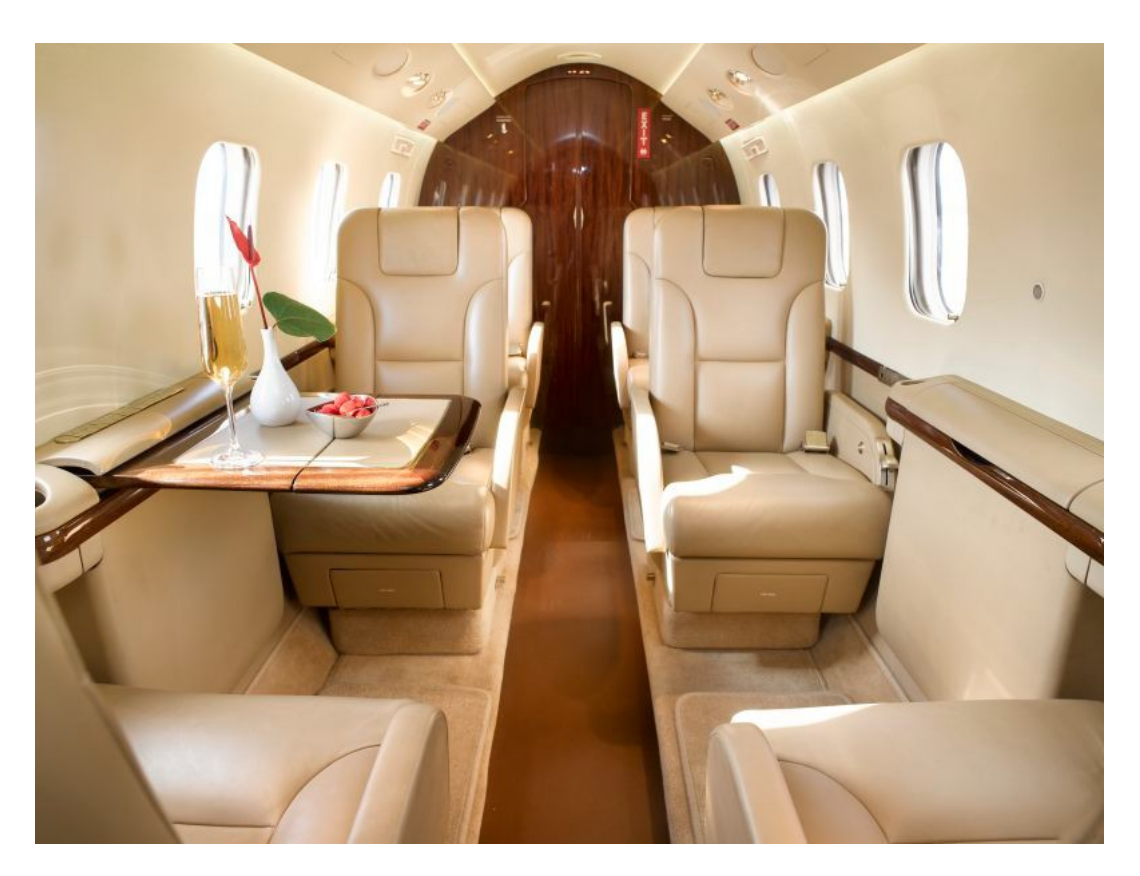
Specifications subject to verification upon inspection. Aircraft subject to prior sale.

Removable Matching Vinyl Runner for Cabin Entrance and Center Isle