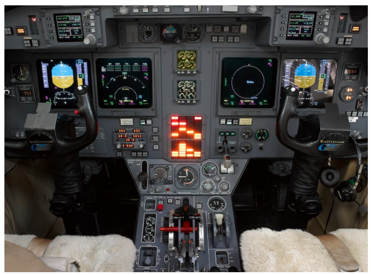
Specifications subject to verification upon inspection. Aircraft subject to prior sale.

GLOBAL HEADQUARTERS 5525 N.W. 15<sup>th</sup> Avenue, Suite 301B · Fort Lauderdale, Florida 33309 +1 (954) 703-1600 · www.eastcoastjetcenter.com