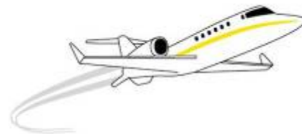
Learjet 45-0197 Specifications (Cont'd)