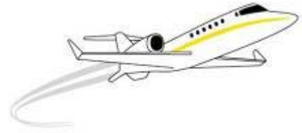
Learjet 45-0199 Specifications (Cont'd)