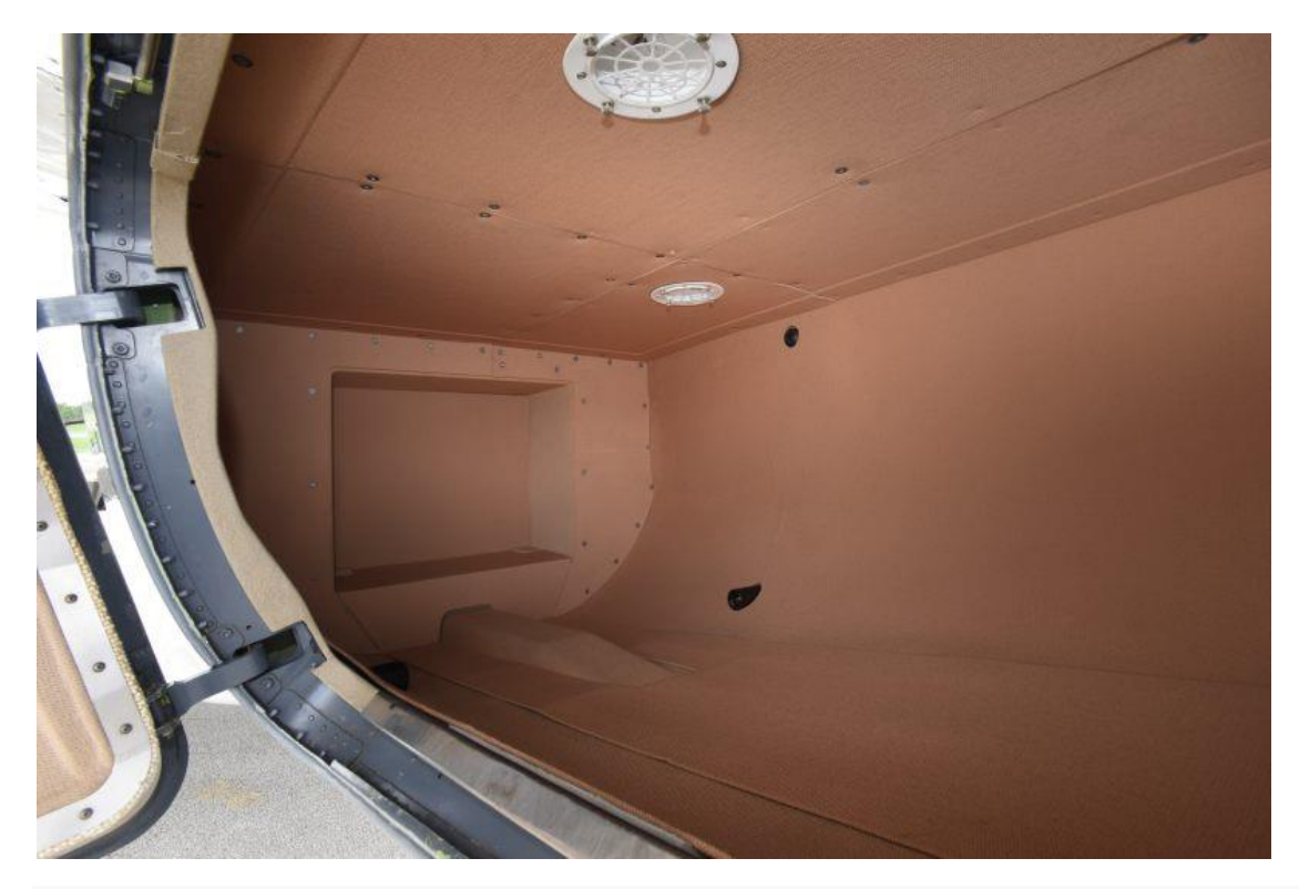
An external compartment provides 50 cubic feet of baggage space with an additional 15 cubic feet of storage in the interior.

FORT LAUDERDALE * MONTERREY * SAO PAULO * MOSCOW