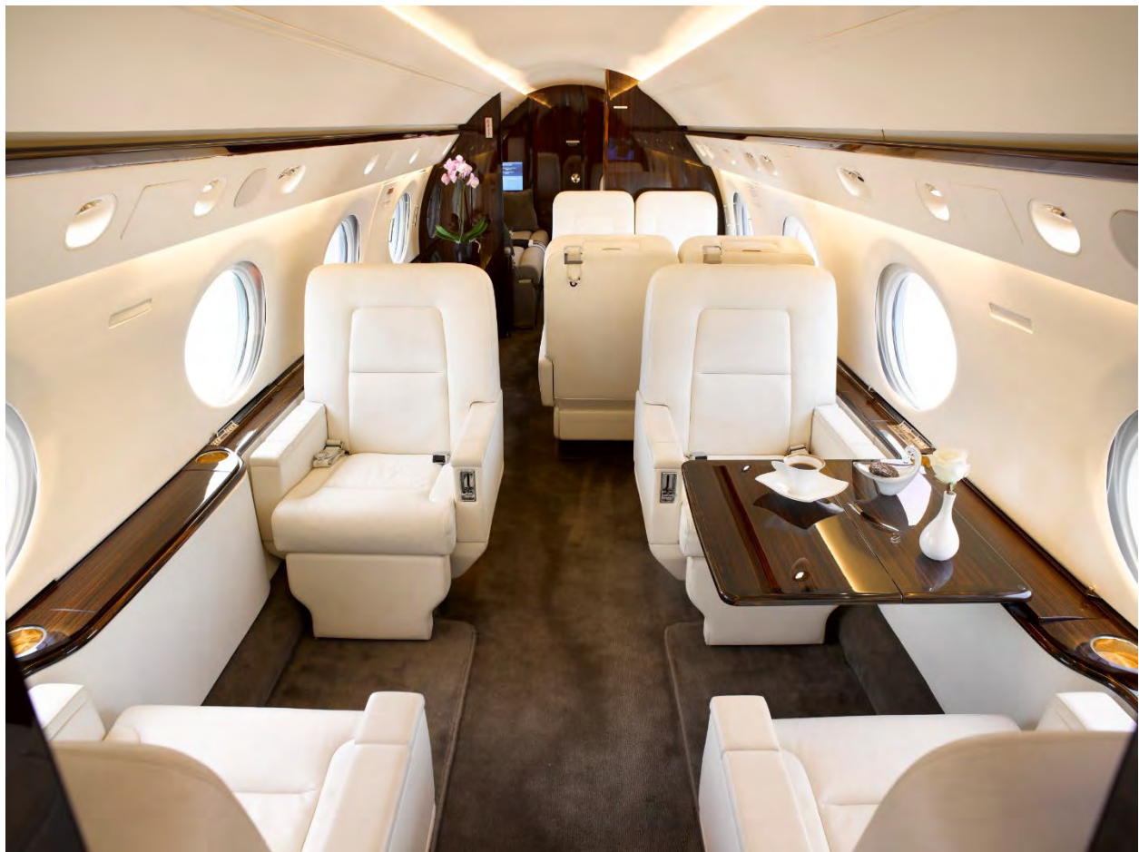
CABIN FACING AFT

2000 Gulfstream GV, Serial 582 Specifications (Cont'd)