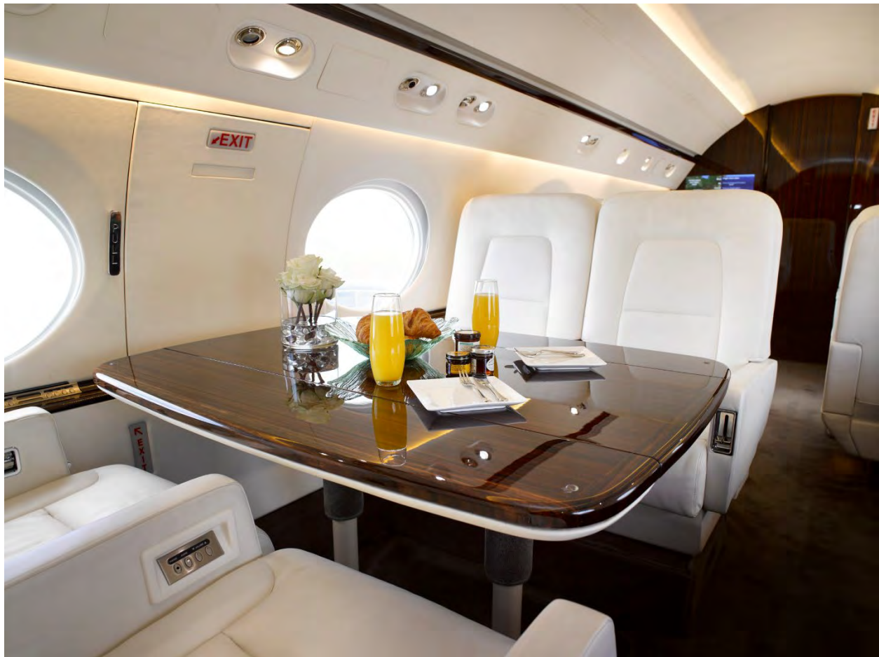
MID CABIN DINING

2000 Gulfstream GV, Serial 582 Specifications (Cont'd)