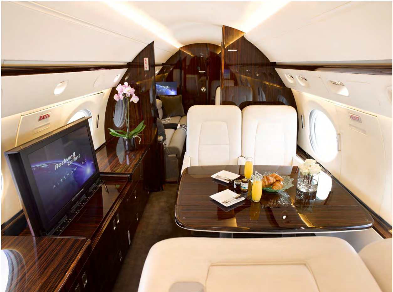
MID CABIN CREDENZA

2000 Gulfstream GV, Serial 582 Specifications (Cont'd)