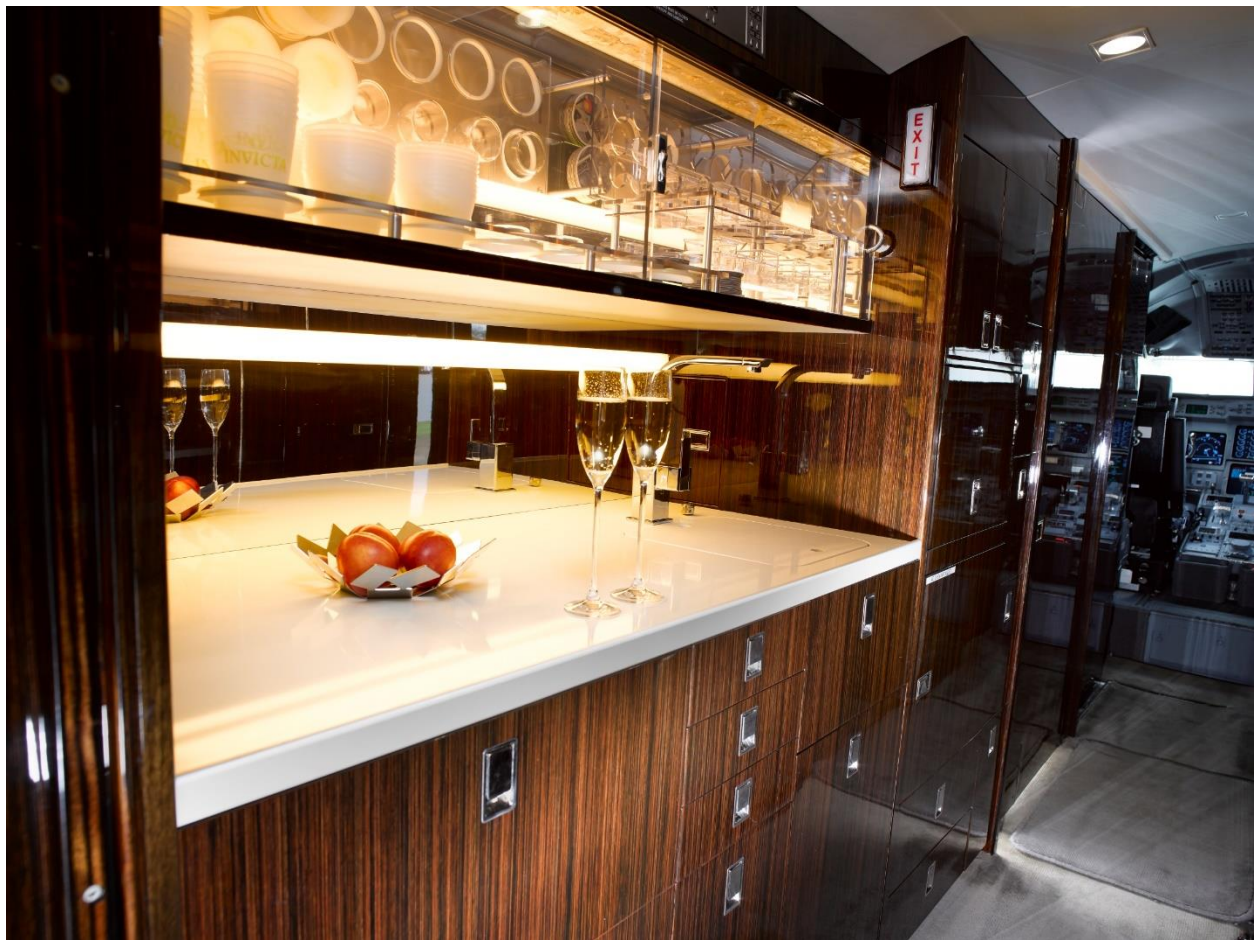
FORWARD GALLEY ADJACENT CREW REST

2000 Gulfstream GV, Serial 582 Specifications (Cont'd)